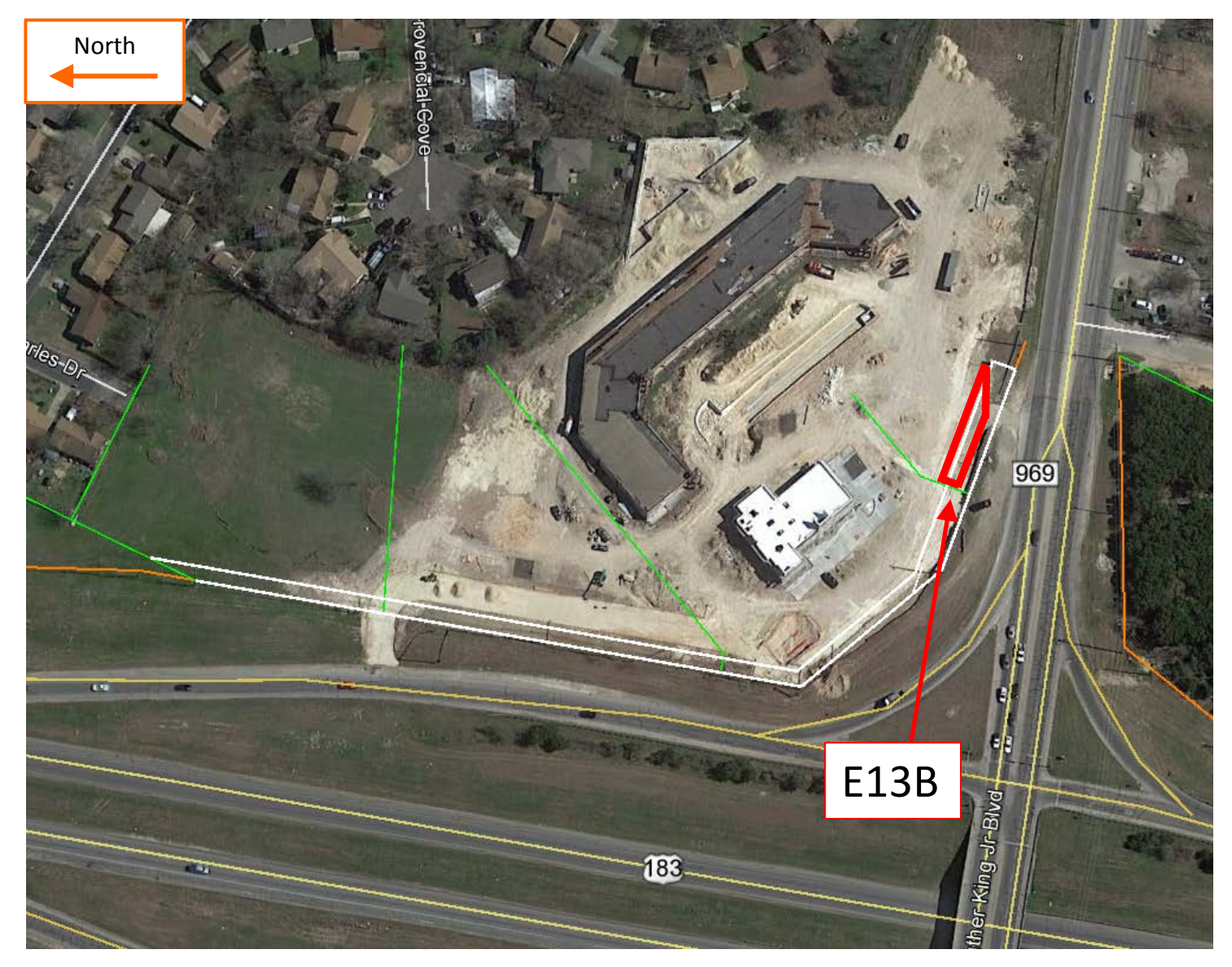
Parcel E13B – Approximately 1,927 Square Feet (0.044 Ac).